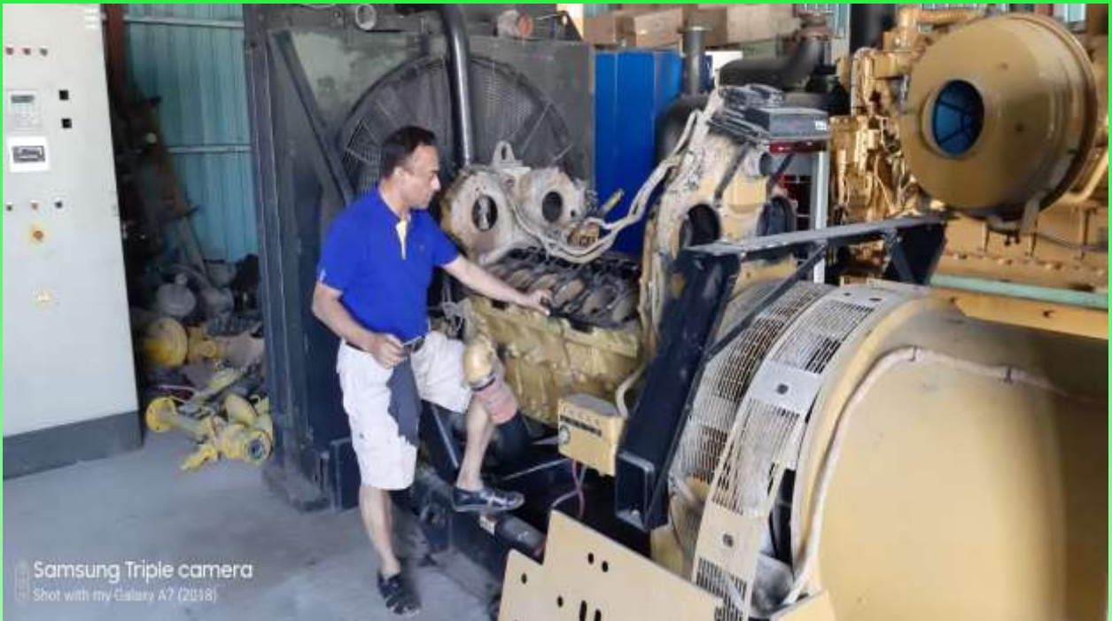
ENGINE MODIFICATION FOR INTERCOOLER AIR-GAS RATIO