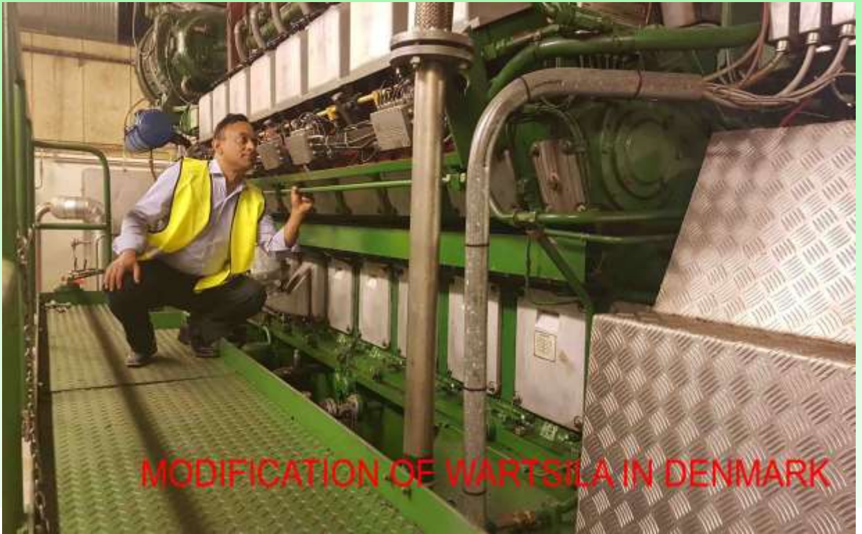
MODIFICATION OF WARTSILA IN DENMARK