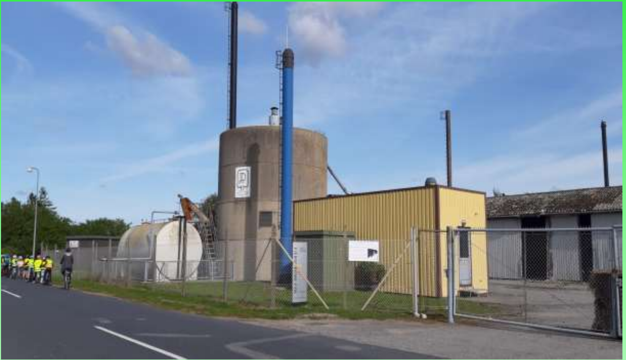
DAVINDE BIO-GAS PLANT OWNED BY THIS TEAM