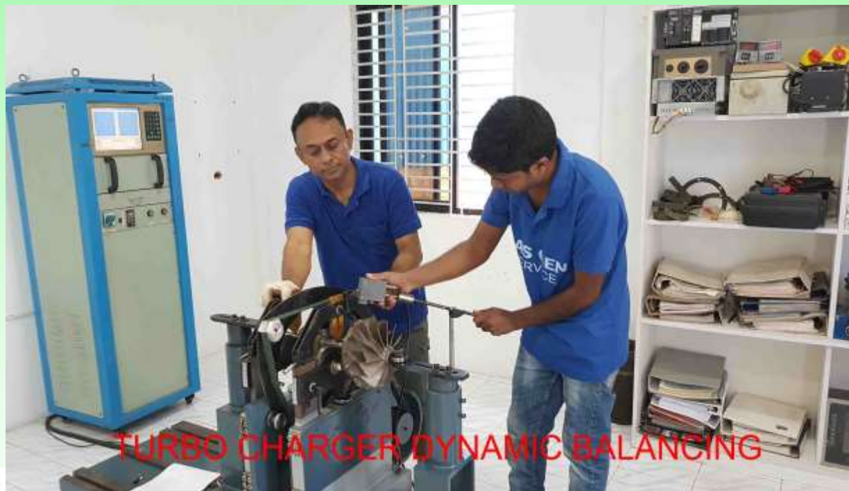
TURBO CHARGER DYNAMIC BALANCING