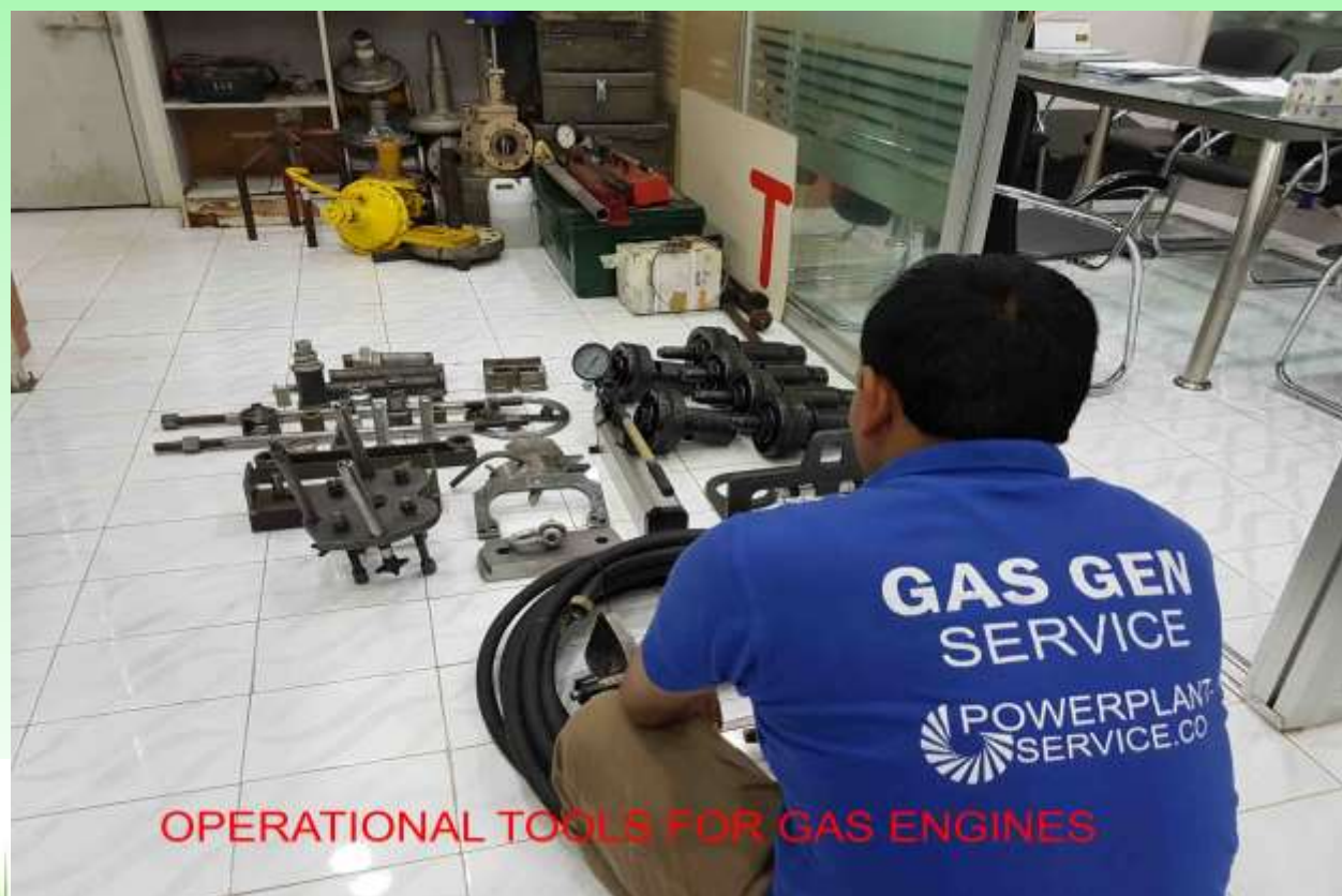
OPERATIONAL TOOLS FOR GAS ENGINES