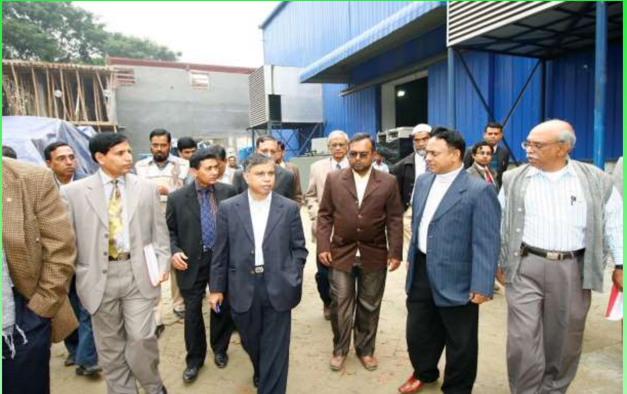
Handover Ceremony and Briefing to Energy Secretary