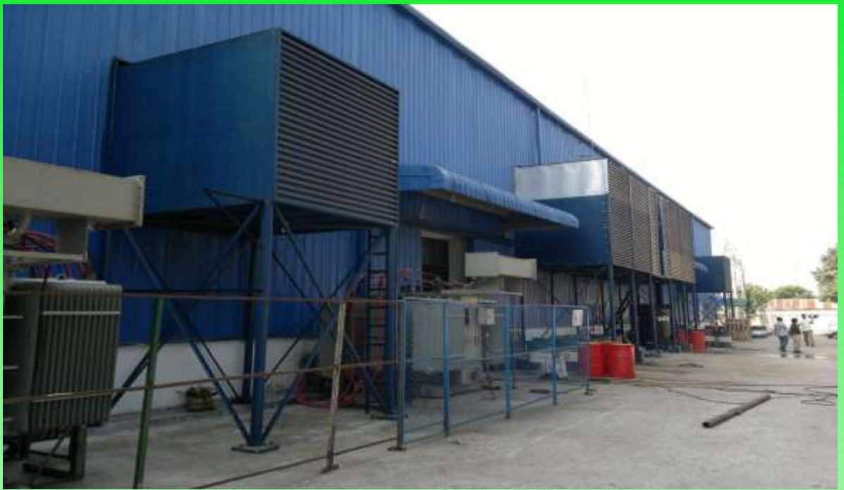
20 MW Rental Power Plant at Bogra Unit MWM