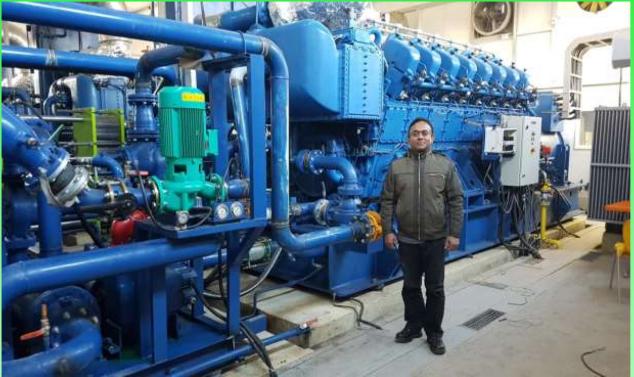
NATURAL GAS GENSET BEING MODIFIED FOR NOX COMPLIANCE