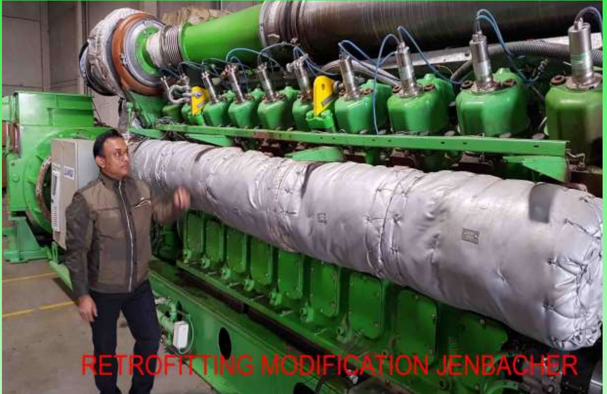
RETROFITTING MODIFICATION JENBACHER