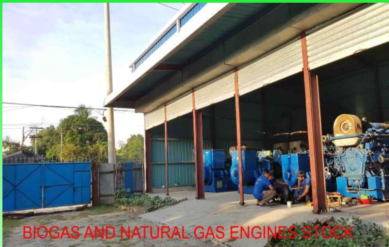
BIOGAS AND NATURAL GAS ENGINES STOCK