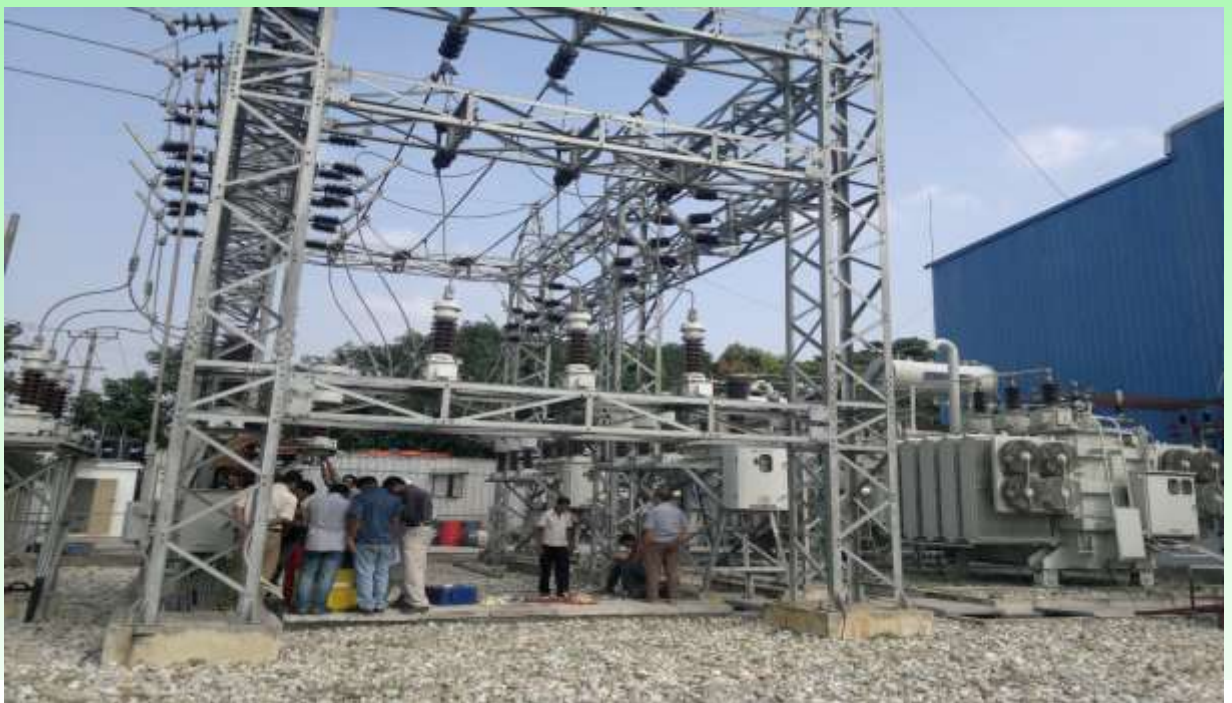
GRID SWITCH yard of 20 MW Energy Prima of HOSAF GROUP