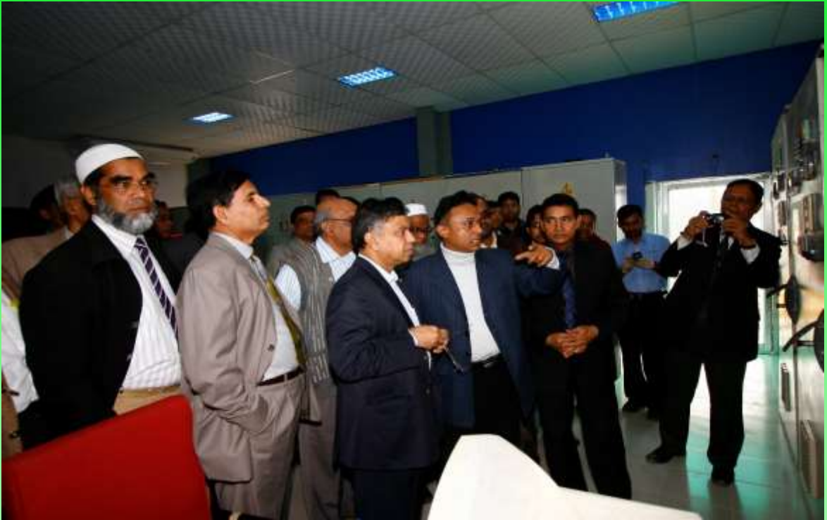
Commercial Operation Test of 20 MW Power Plant- Present ENERGY SECRETARY