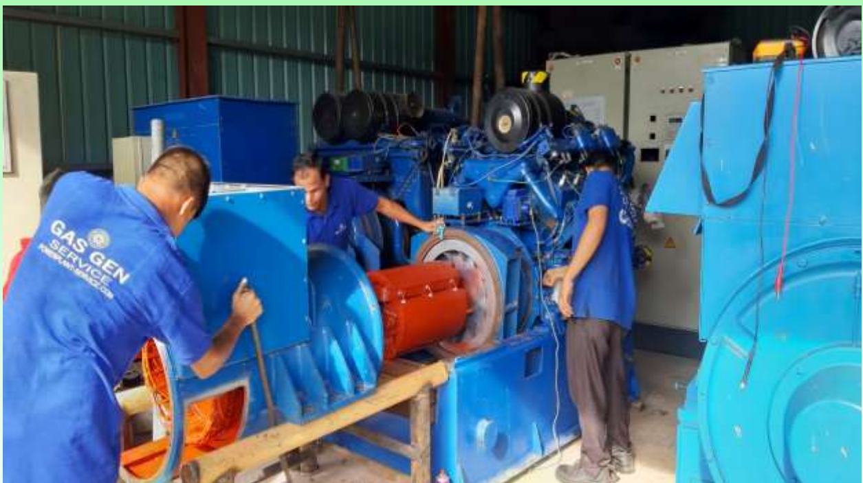
ROTOR REWINDING OF GAS GENERATOR AT GASGEN SERVICE GAS GEN & EQUIPMENTS LTD IS PRESENTLY OWNED BY THIS TEAM