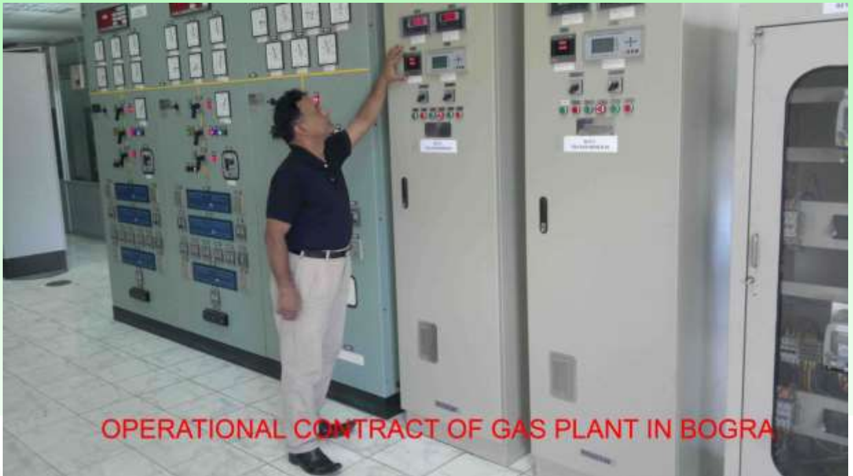
OPERATIONAL CONTRACT OF GAS PLANT IN BOGRA