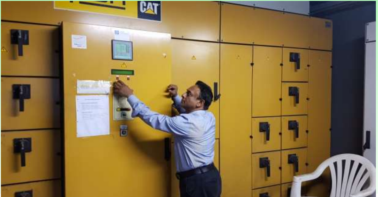
ENERGY BALANCING WITH GRID POWER BY THIS TEAM