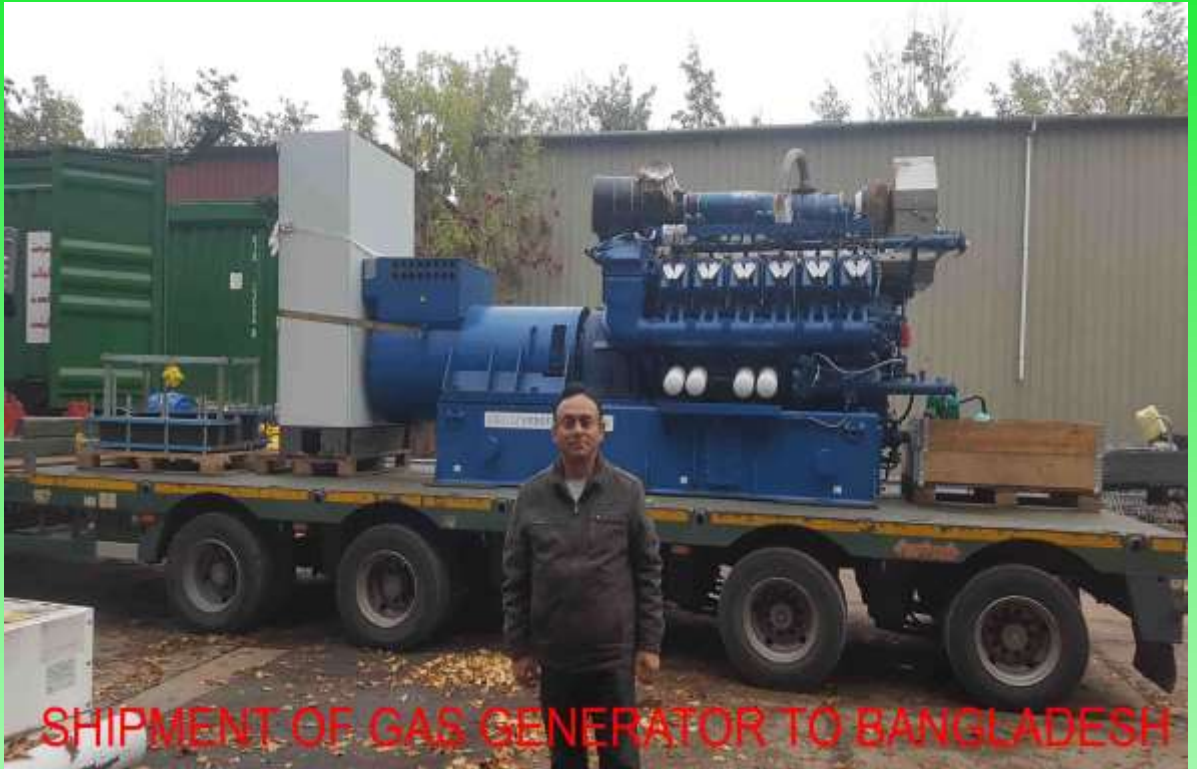
SHIPMENT OF GAS GENERATOR TO BANGLADESH