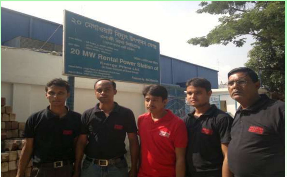
Engineers of GASGEN at 20 MW Rental Power Plant at Bogra Unit MWM